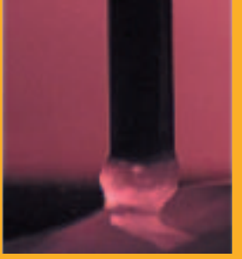
B. When the "ball" shorts to C. Automatically, a precision D. STT® circuitry rethe puddle, the current is reduced to a low level allowing the molten ball to wet into the puddle.