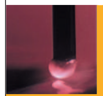
A. STT® produces a uniform molten ball and maintains it until the "ball" shorts to the puddle.