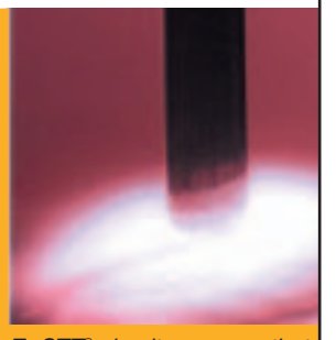
E. STT® circuitry senses that the arc is re-established, and automatically applies PEAK CURRENT, which sets the proper arc length. Following PEAK CURRENT, internal circuitry automat-ically switches to the BACKGROUND CURRENT, which serves as a fine heat control.